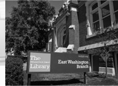
East Washington Mid-South Region