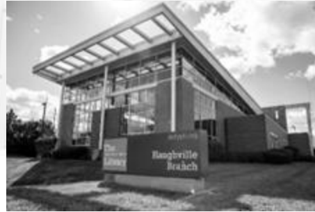
Haughville West Region