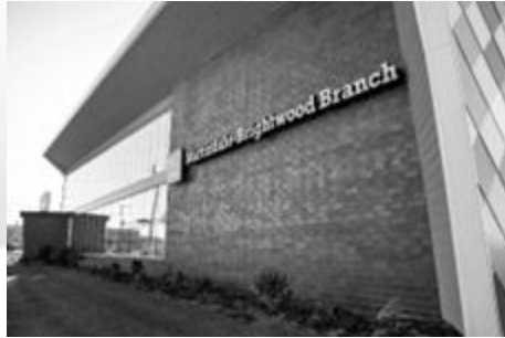
Martindale - Brightwood East Region