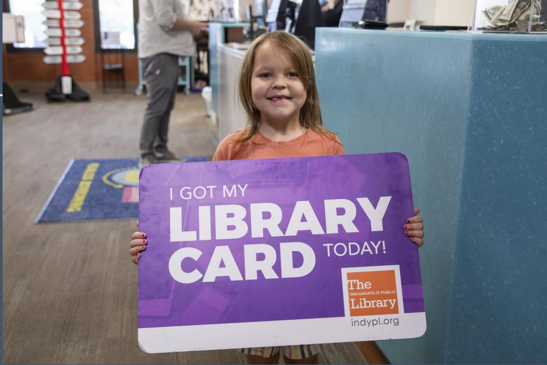
Typical Day at IndyPL